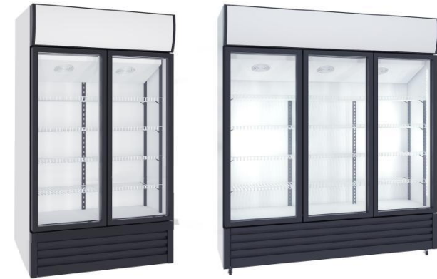
SC300 LC-600/ LC-700