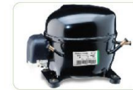
● High-efficiency compressor