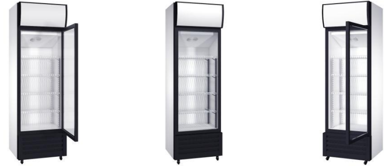
LC-150/ LC-185 / LC-300 / LC-400