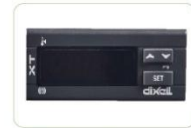
● Elf Controller