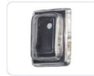
• LED light switch