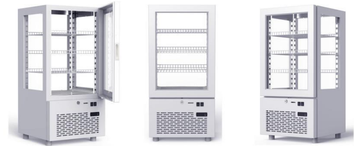
SC-63F / SC/SH-58F