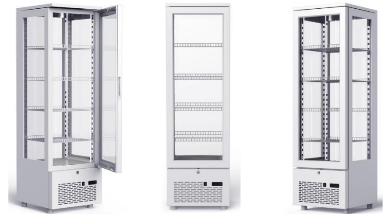
SC/SH-188F / SC/SH-228F / SC/SH-268F