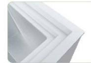
● Foam layer thickness